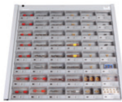
48 - Lid 24 long, 36, 48