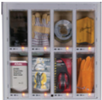
Standard Density Lids 2, 4, 6, 8, 12