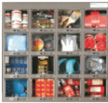
High Density Lids 16, 24